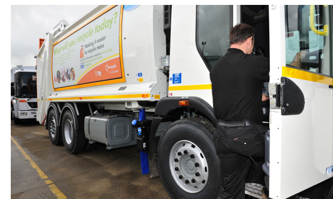
DriveLock automatically identifies authorised personnel

DriveLock, puts you back in control – providing you with the reassurance and confidence that only your drivers can operate your vehicles.