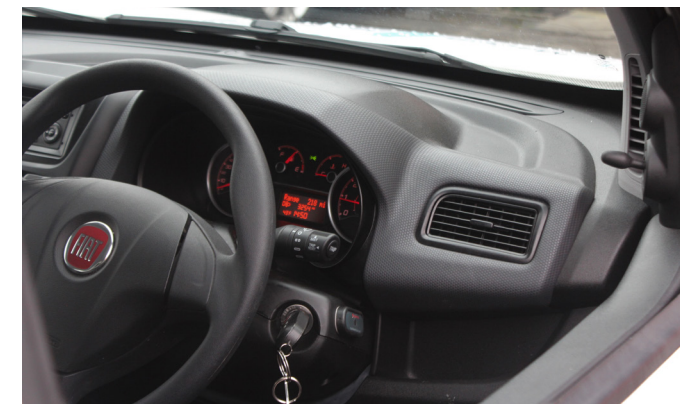
Protect unattended vehicles whatever condition they are left

A vehicle left in this condition is not only vulnerable to theft or misuse, placing personnel and members of the public at risk of injury, but it could also be breaching Road Regulations exposing you to the threat of prosecution under an offence commonly termed as 'quitting'.